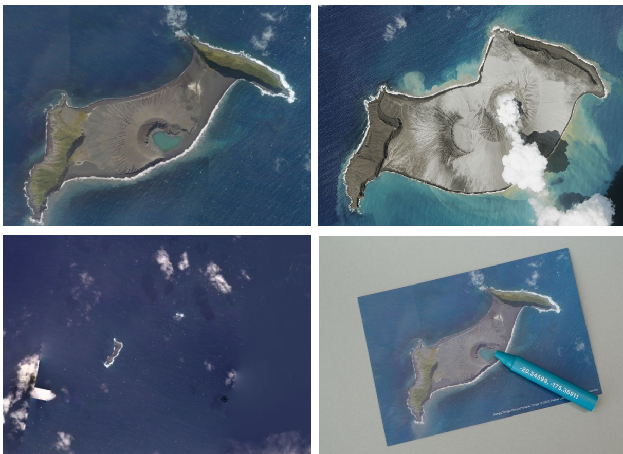
Hunga Tonga-Hunga Ha'apai