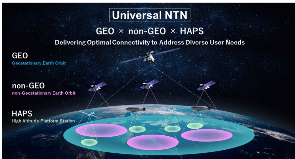
Network Image of "Universal NTN"