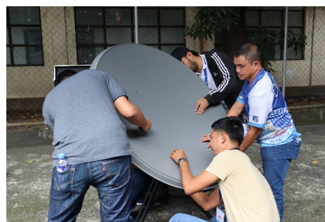
Activities by WFP in the Philippines