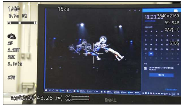
Figure 4: Transmitted 4K video image.

We successfully transmitted both 4K video and IoT data using the testbed. In this experiment, we verified that even under the influence of latencies caused by long-distance transmission, including satellite and Japan–Europe terrestrial links, it was possible to establish a communication session using 5G control signals exchanged between the customer-premises equipment (CPE, 5G gateway) *5 in Japan and the 5G core *6 in Europe; subsequently, the data acquired by the 4K camera and IoT sensor in Japan were transmitted to a PC and data server in Europe. Furthermore, we measured the network quality of each transmission segment and evaluated the network performance by connecting satellite links and 5G. Figure 4 shows that the 4K video image was transmitted from Japan to the Europe without any problems. Figure 5 shows a time-series graph of the sensor data acquired in Japan and received by the data server in Europe (in this case, temperature and humidity information). The results of this joint experiment confirmed that the integration of satellite links in 5G networks via international long-distance communication can be realized in terms of specific application transmission.