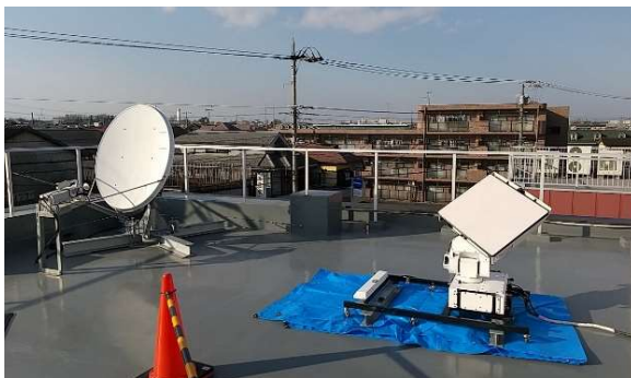
Figure 2: Gateway station and VSAT station.