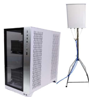
Figure 3: gNB (5G base station).