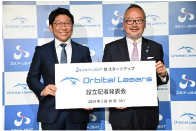
Establishment of Orbital Lasers (2024)