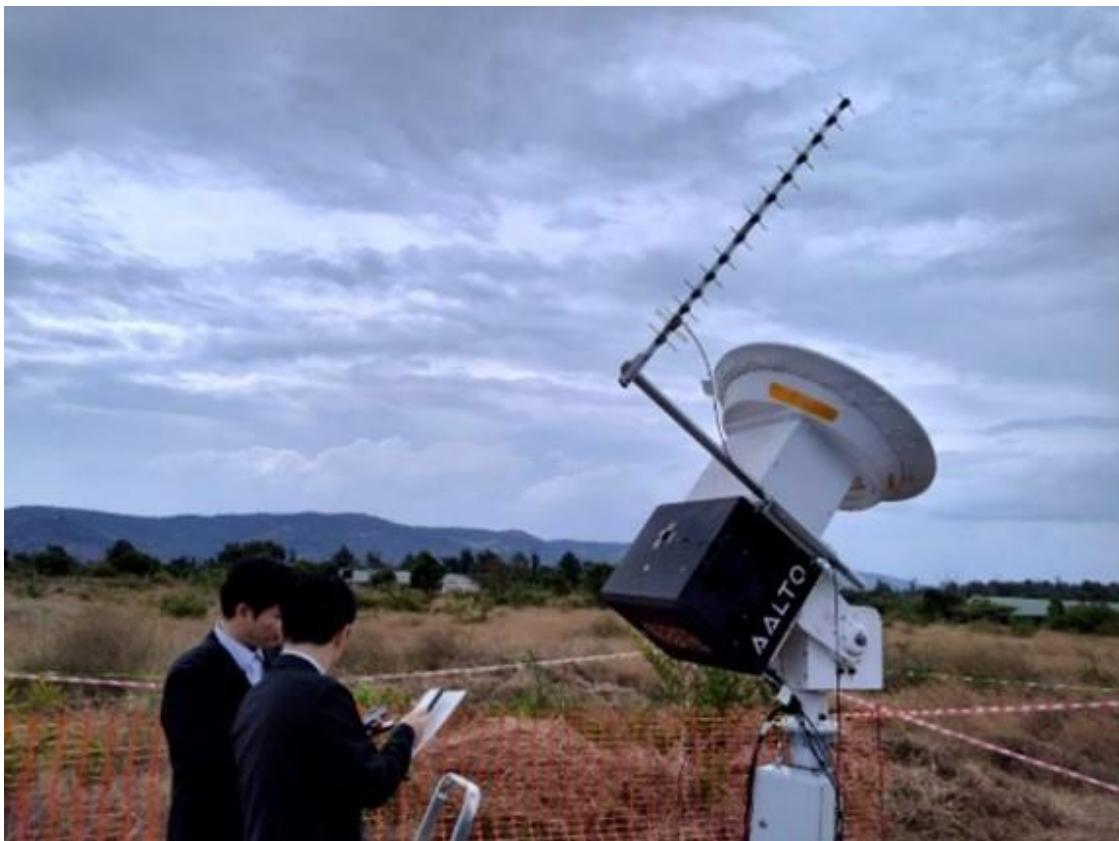
Tracking Status Check