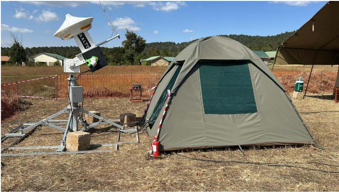
Ground Gateway Station