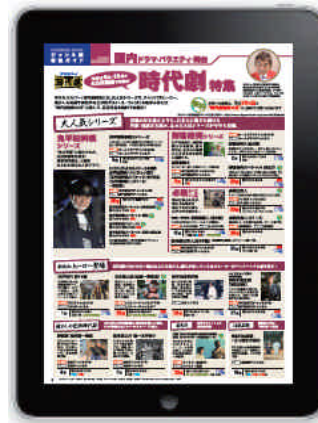
Page Viewer image