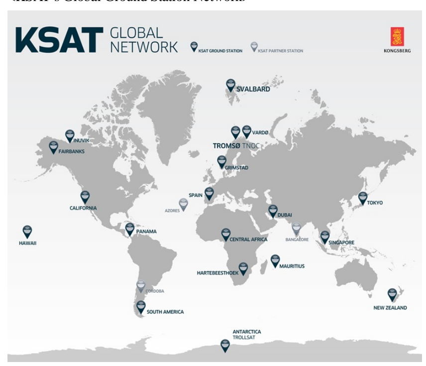
<KSAT Ground Stations in Svalbard (78 °N)>