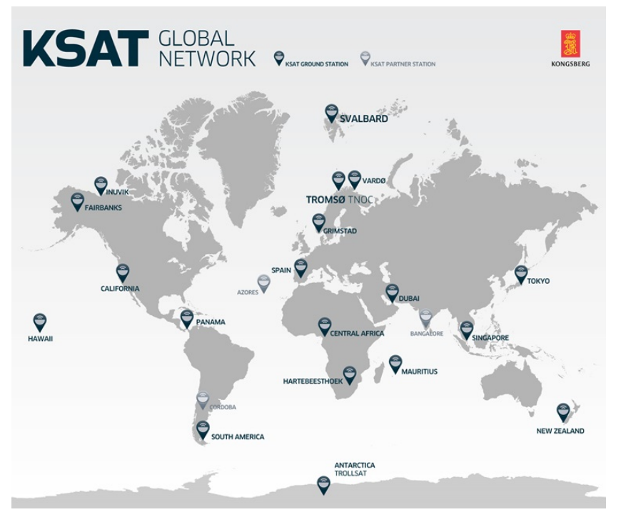
<KSAT Ground Stations in Svalbard (78 \,\,^\circ \! N ) >